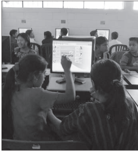
4th grade students use Encarta, a powerful online encyclopedia, to investigate themes during their computer class in our new technology center.

Computers can be powerful learning tools, especially in remote areas where access to resources are limited. The children of Santa Cruz got their first introduction to computers in 2004 when we installed our first mini-lab of 4 donated used computers in a small corner of the school. Since then, our computer lab has undergone improvements each year. Through a generous donation in 2007, we were able to replace the old computers with 10 brand new ones plus a satellite for internet connection. Regular computer classes were established for both primary and secondary students. Computers became tools for learning for the children of Santa Cruz.