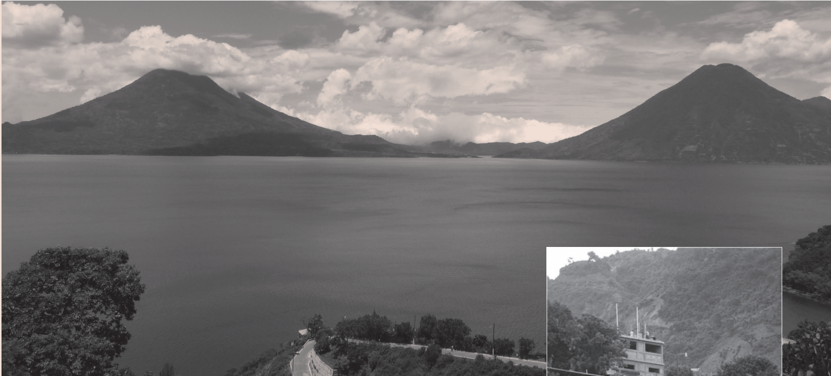
View from the top floor of CECAP where restaurant will be.

Picture this: A three story community center made for and by the people of Santa Cruz to house workshops and classrooms where the young and old can come to learn new skills that can lead them to real life jobs and prosperity for themselves and their families.