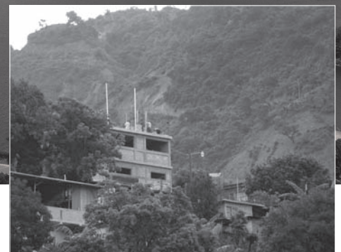
Looking up at CECAP from below. Top floor not yet built.

A year ago we broke ground on this new center and today we are almost there! But to reach the top, we need your help. We still need to raise $10,000 to finish the top floor.