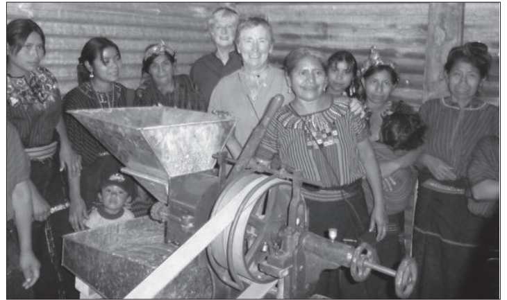
Meet the women of Tzanjomel. Above, the inauguration of their community molino (corn grinder), a gift from Feed the Dream.