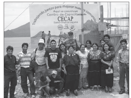
Members of our hardworking CECAP Committee.

Picture how good it will feel to have been a part of making this dream a reality for the people of Santa Cruz. Make CECAP a part of your legacy. Please be as generous as you can to help us reach the top.